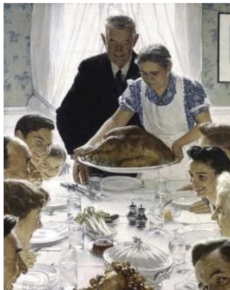
NORMAN ROCKWELL painted Freedom from Want, above, in 1943. It's become known as his Thanksgiving painting.